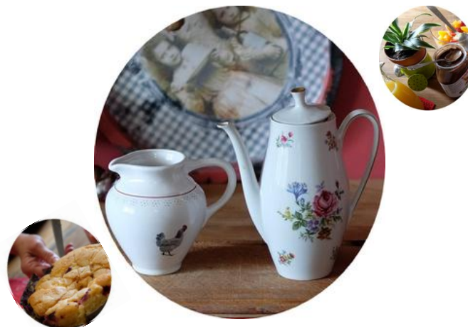
The breakfast is included in the price