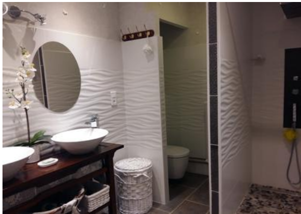
Private bathroom in front of your bedroom