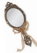
« Secret Alcôve » bedroom Upstairs. Twin beds (2X80) Price : 55€