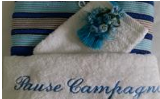
Bathrobes, towels and bathroom accessories are available on site.