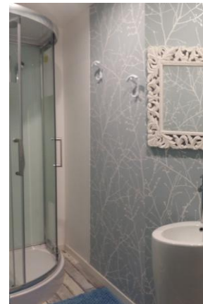
Bathroom integrated in the bedroom Toilets out of the bedroom just in front